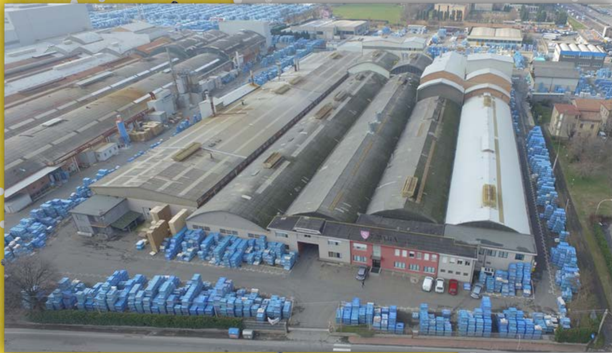
↑ Werk in Fiorano Modenese