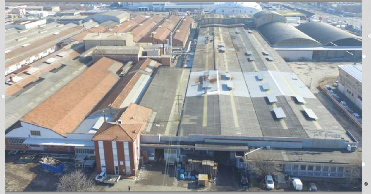
↑ Werk in Sassuolo