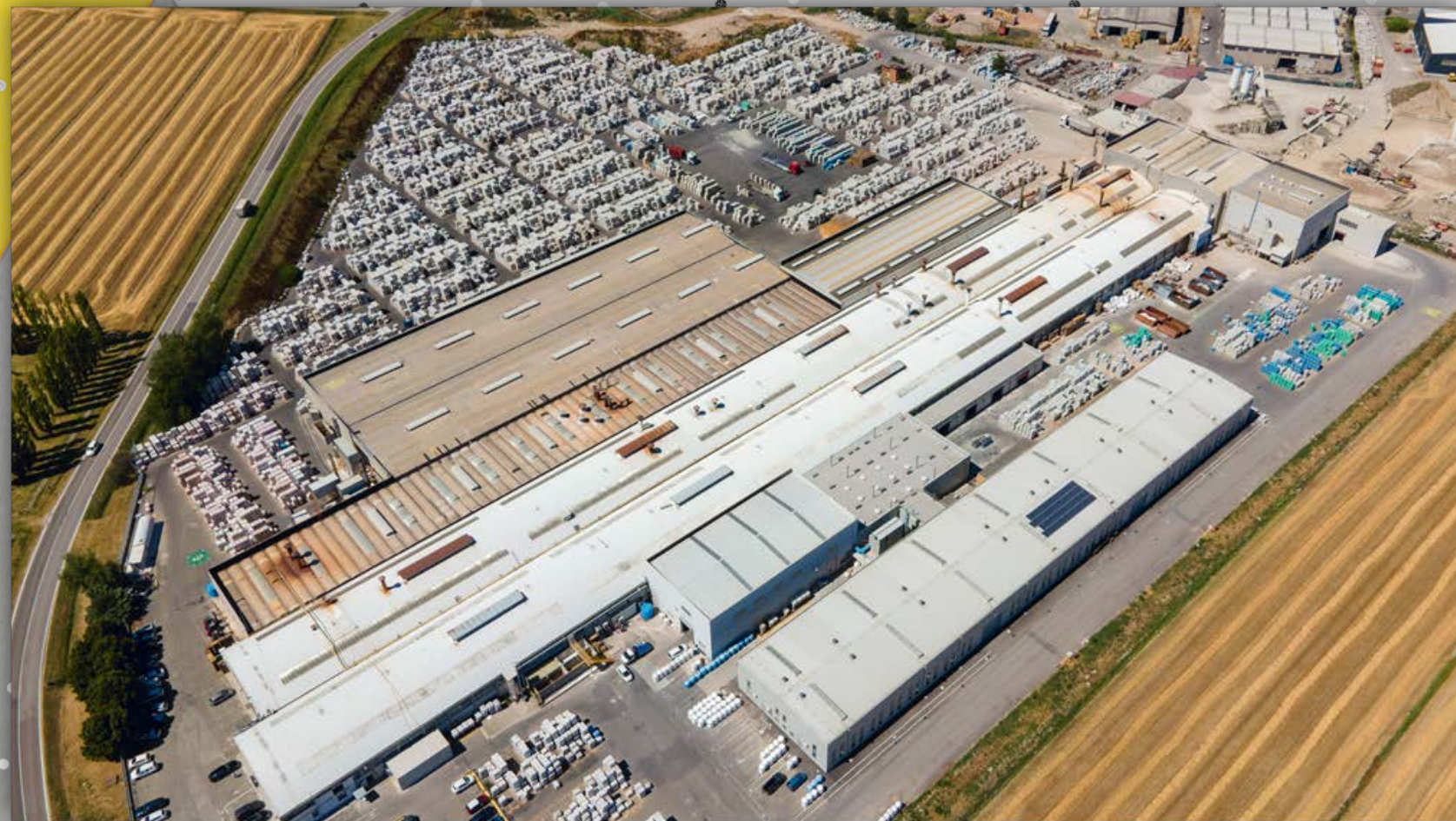
→ Werk in Finale Emilia